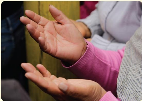
MARISA CZL / CATHOPIC