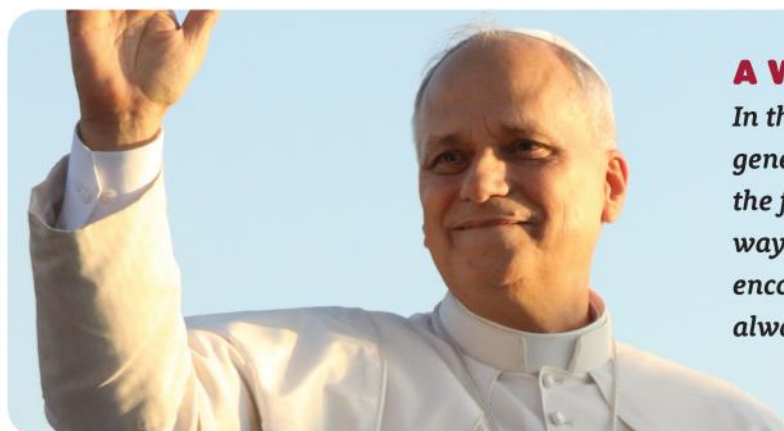
ANTONELLA ULLAURI / CATHOPIC

Go to DearPadre.org to send your question and to learn more about Dear Padre .