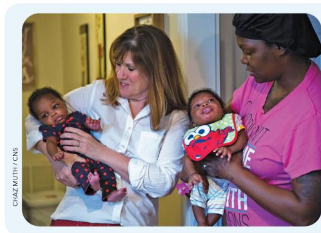
CHAZ MUTH / CNS