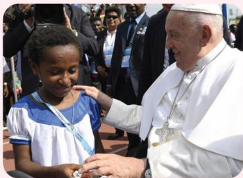
CATHOLIC NEWS SERVICE