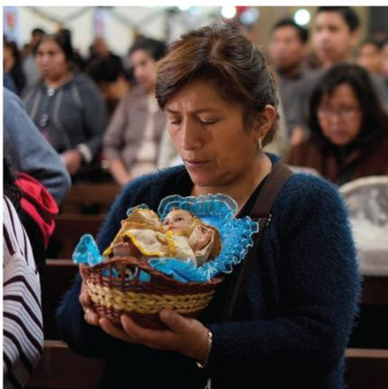
A woman holds a figurine of the Christ Child during Mass on the feast of the Epiphany.

Epiphany, on the other hand, is made for celebration, gift-giving, going all out. Perhaps someday we can return to the traditions of Epiphany and restore Christmas as a day of rejoicing and worship.