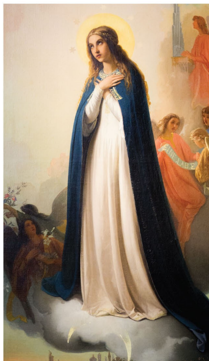
THE ASSUMPTION OF THE VIRGIN MARY, PAVIA CATHEDRAL

From Catholic and Cornered: Answers to Common Questions About Your Faith , © 2011 Liguori Publications